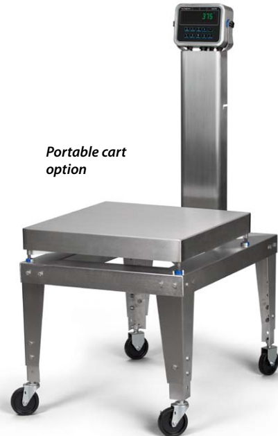
Portable cart option

Avery Weigh-Tronix - USA 1000 Armstrong Drive, Fairmont, MN 56031-1439 USA usinfo@awtxglobal.com Toll-Free: (800) 533-0456 Phone: (507) 238-4461