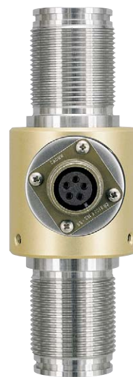
SGMT Designed for overhead suspension. Optional eye nut available.

See back page & Dillon Load Cells specifications sheet for more dimensions and detail