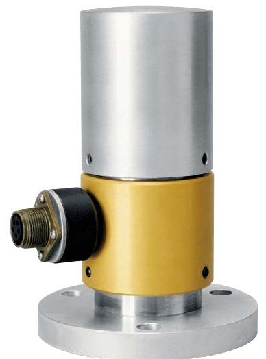
SGMC Includes cap and base.